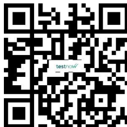
Figure 3: QR Code to TEST NOW Platform

The HIVST shall be provided with the QR code as in Figure 3 (on label and IFU) in order to allow the user to get further assistance and report the results obtained (positive/negative/invalid) from the test. The statement of visit to the TEST NOW platform is needed to be stated in the IFU as to guide and introduce the user with the TEST NOW platform.