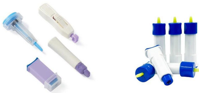
Figure 4: Examples of single use personal safety lancet

The finger prick needle that will be supplied in the kit shall be sterile and single use personal lancets and is intended to be used with lancing device (safety lancet) by lay users for finger prick blood sampling as example shown in Figure 4 below.